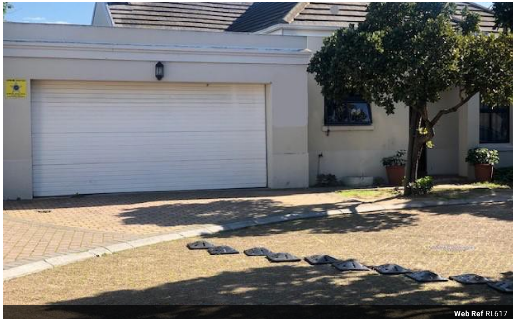
Web Ref RL617

Suite 304, 47 on Strand, Strand Street, Cape Town