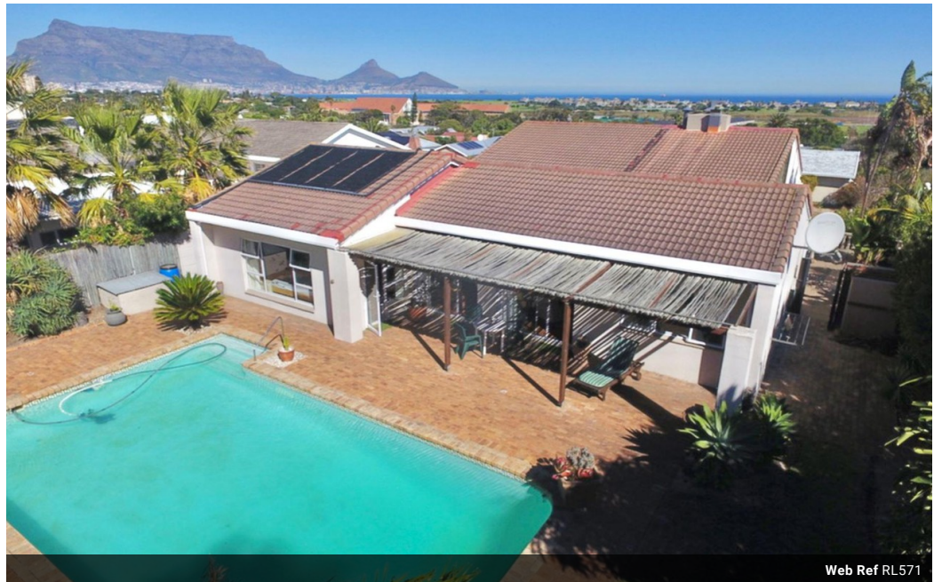
Web Ref RL571

Suite 304, 47 on Strand, Strand Street, Cape Town