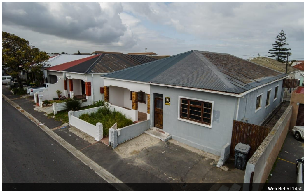
Web Ref RL1450

Suite 304, 47 on Strand, Strand Street, Cape Town