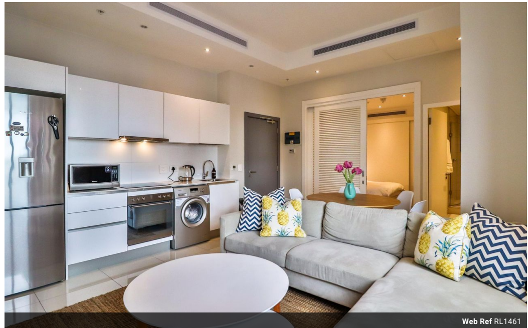
Web Ref RL1461

Suite 304, 47 on Strand, Strand Street, Cape Town