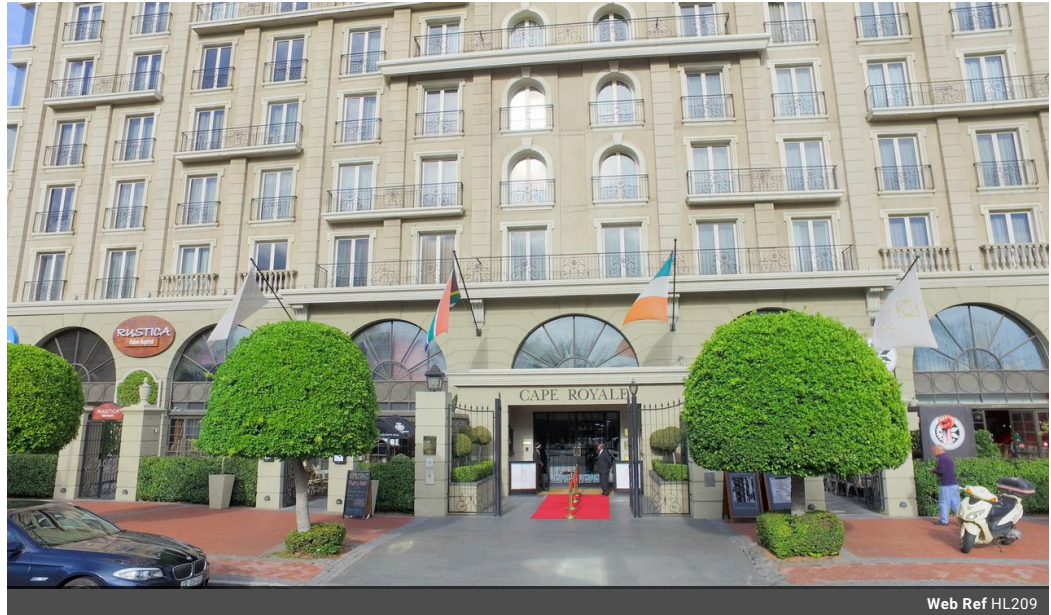
Web Ref HL209

Suite 304, 47 on Strand, Strand Street, Cape Town