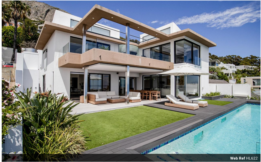
Web Ref HL622

Suite 304, 47 on Strand, Strand Street, Cape Town