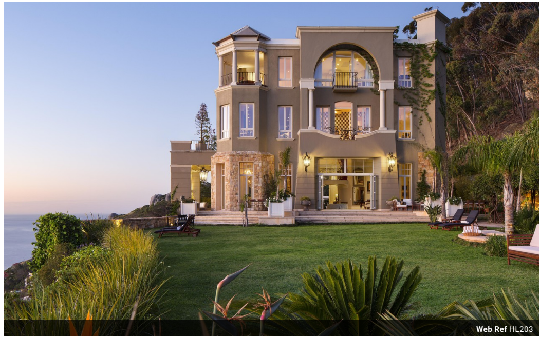
Web Ref HL203

Suite 304, 47 on Strand, Strand Street, Cape Town