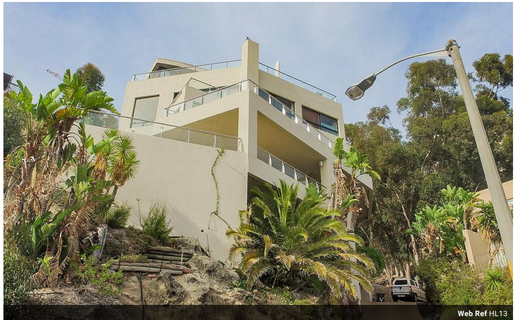
Web Ref HL13

Suite 304, 47 on Strand, Strand Street, Cape Town