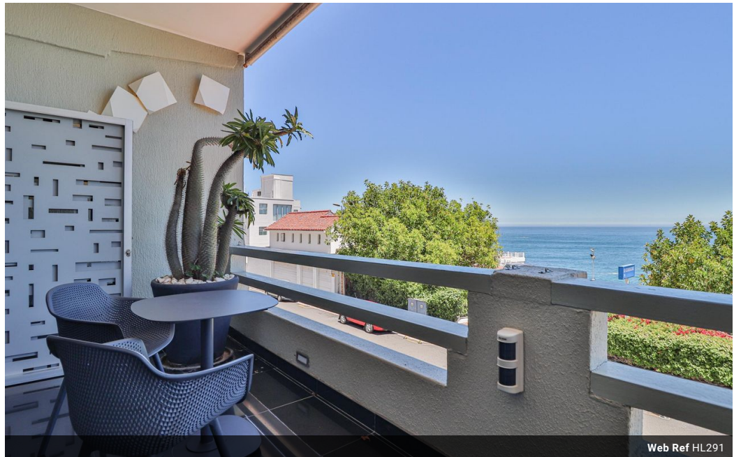
Web Ref HL291

Suite 304, 47 on Strand, Strand Street, Cape Town