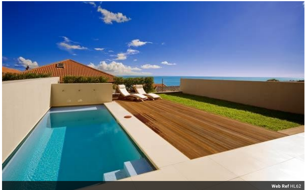
Web Ref HL62

Suite 304, 47 on Strand, Strand Street, Cape Town