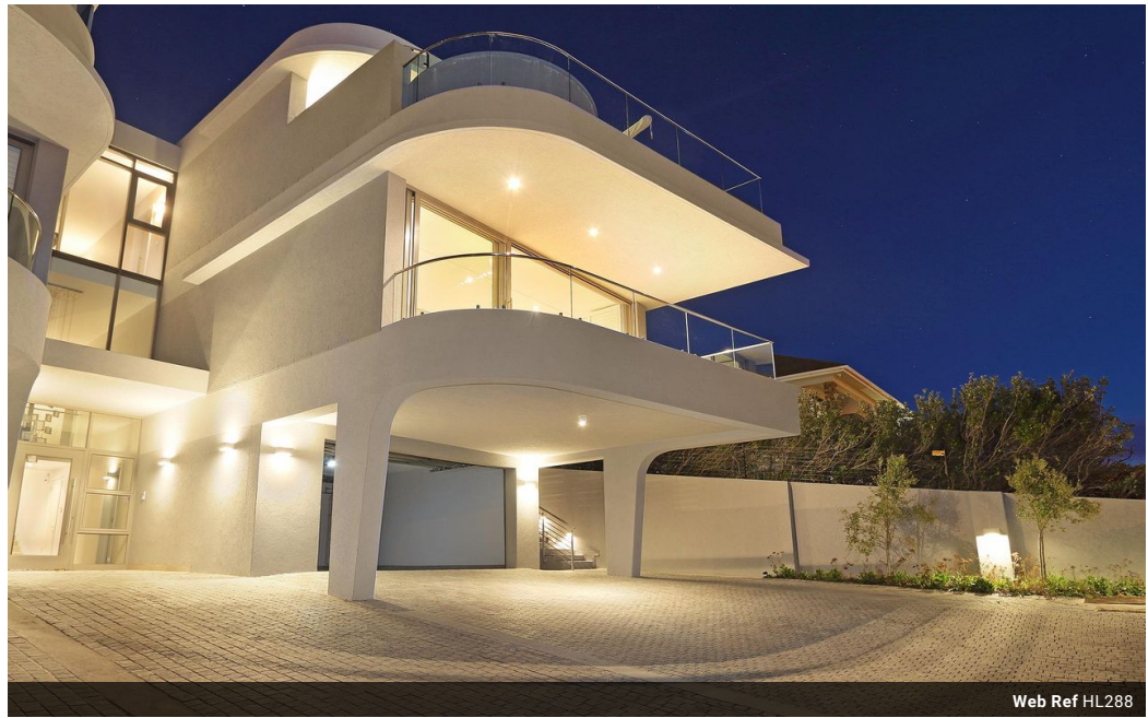
Web Ref HL288

Suite 304, 47 on Strand, Strand Street, Cape Town