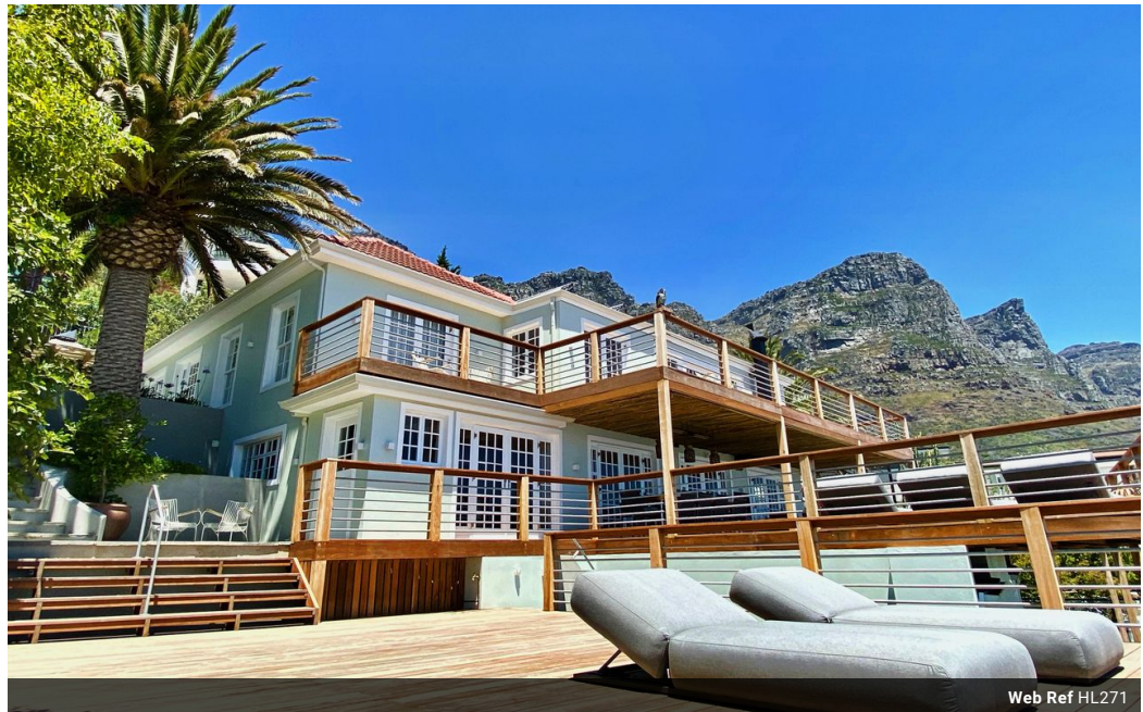
Web Ref HL271

Suite 304, 47 on Strand, Strand Street, Cape Town