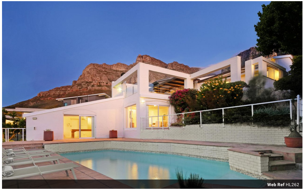
Web Ref HL262

Suite 304, 47 on Strand, Strand Street, Cape Town