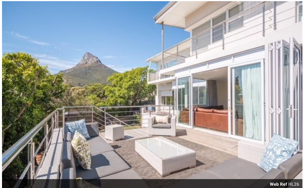
Web Ref HL26

Suite 304, 47 on Strand, Strand Street, Cape Town