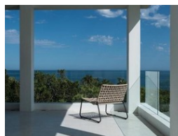
Web Ref HL167