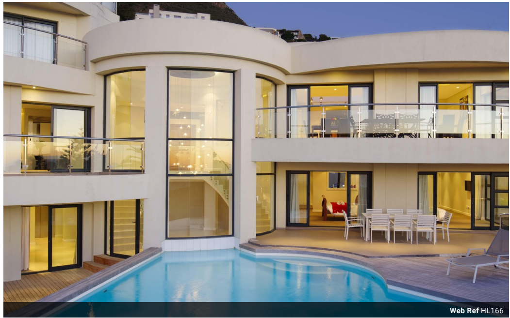
Web Ref HL166

Suite 304, 47 on Strand, Strand Street, Cape Town