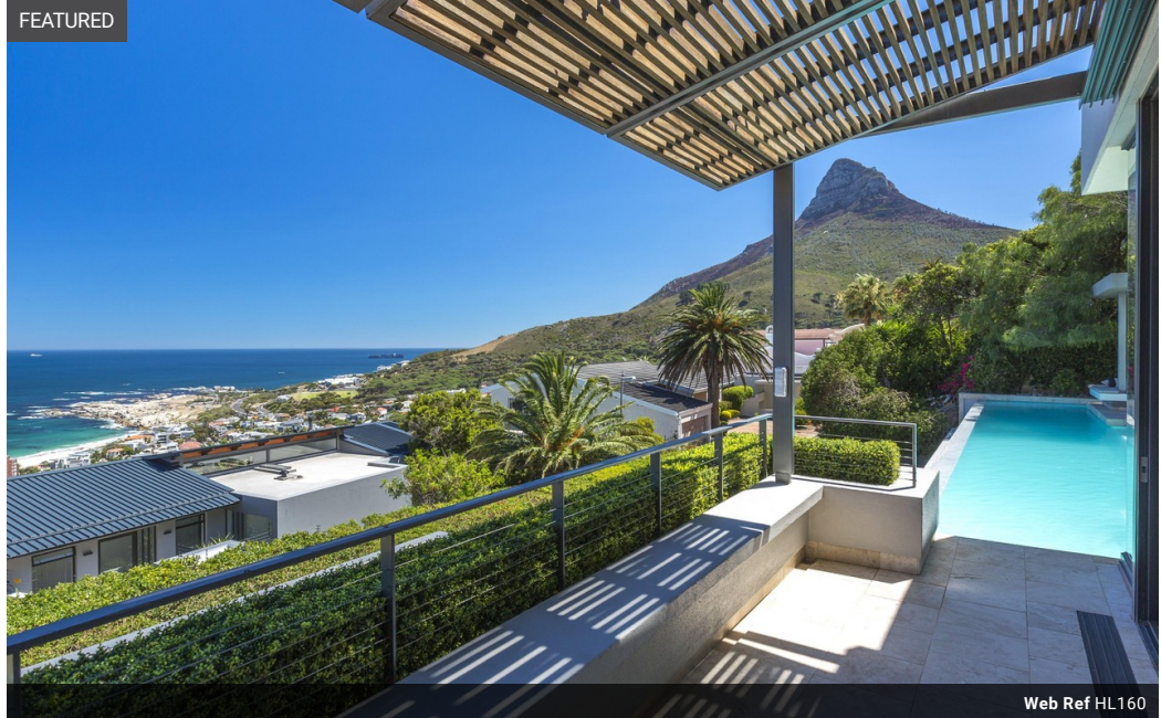
Web Ref HL160

Suite 304, 47 on Strand, Strand Street, Cape Town