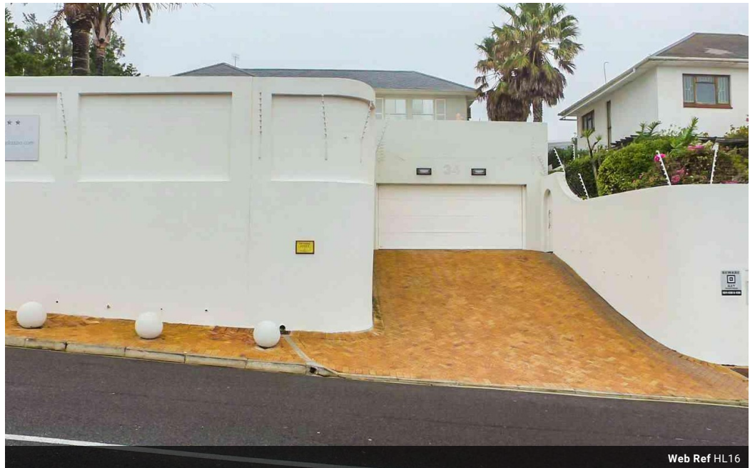
Web Ref HL16

Suite 304, 47 on Strand, Strand Street, Cape Town