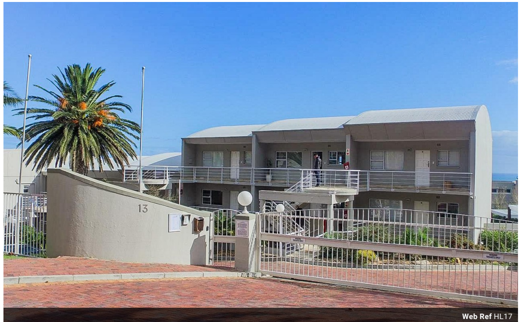
Web Ref HL17

Suite 304, 47 on Strand, Strand Street, Cape Town