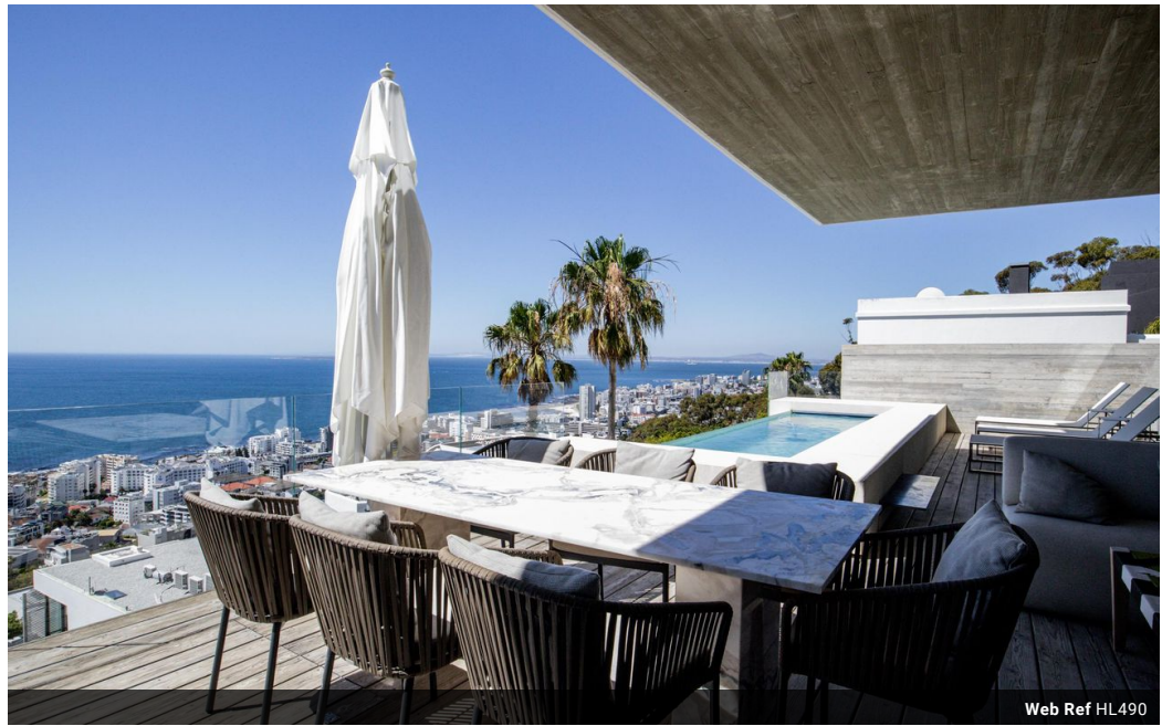
Web Ref HL490

Suite 304, 47 on Strand, Strand Street, Cape Town