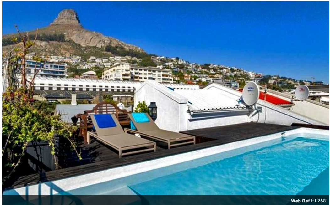
Web Ref HL268

Suite 304, 47 on Strand, Strand Street, Cape Town