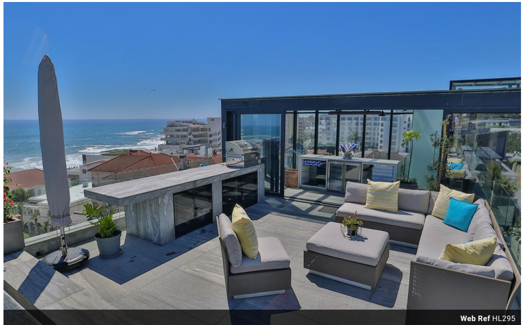
Web Ref HL295

Suite 304, 47 on Strand, Strand Street, Cape Town