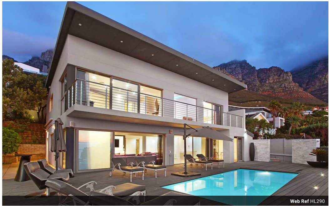
Web Ref HL290

Suite 304, 47 on Strand, Strand Street, Cape Town