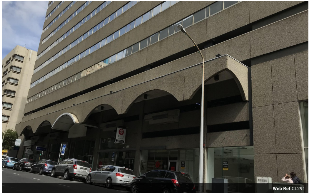
Web Ref CL291

Suite 304, 47 on Strand, Strand Street, Cape Town