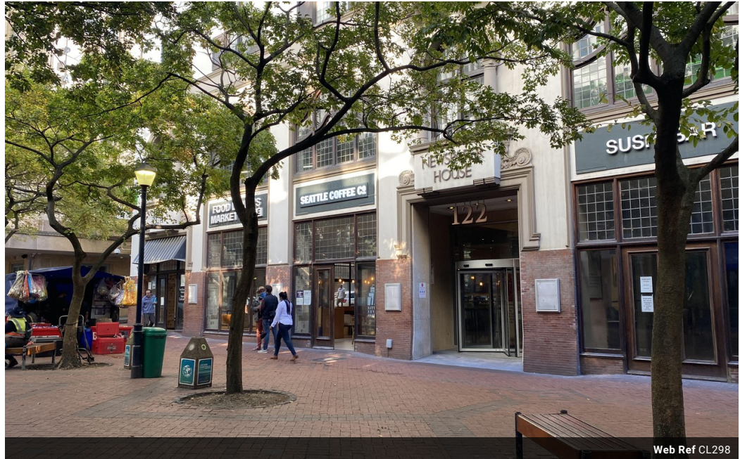
Web Ref CL298

Suite 304, 47 on Strand, Strand Street, Cape Town