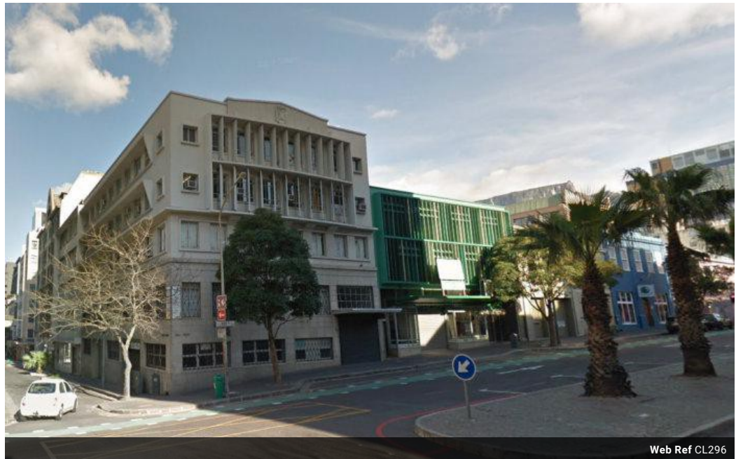
Web Ref CL296

Suite 304, 47 on Strand, Strand Street, Cape Town