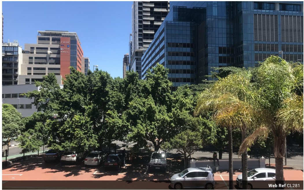
Web Ref CL281

Suite 304, 47 on Strand, Strand Street, Cape Town