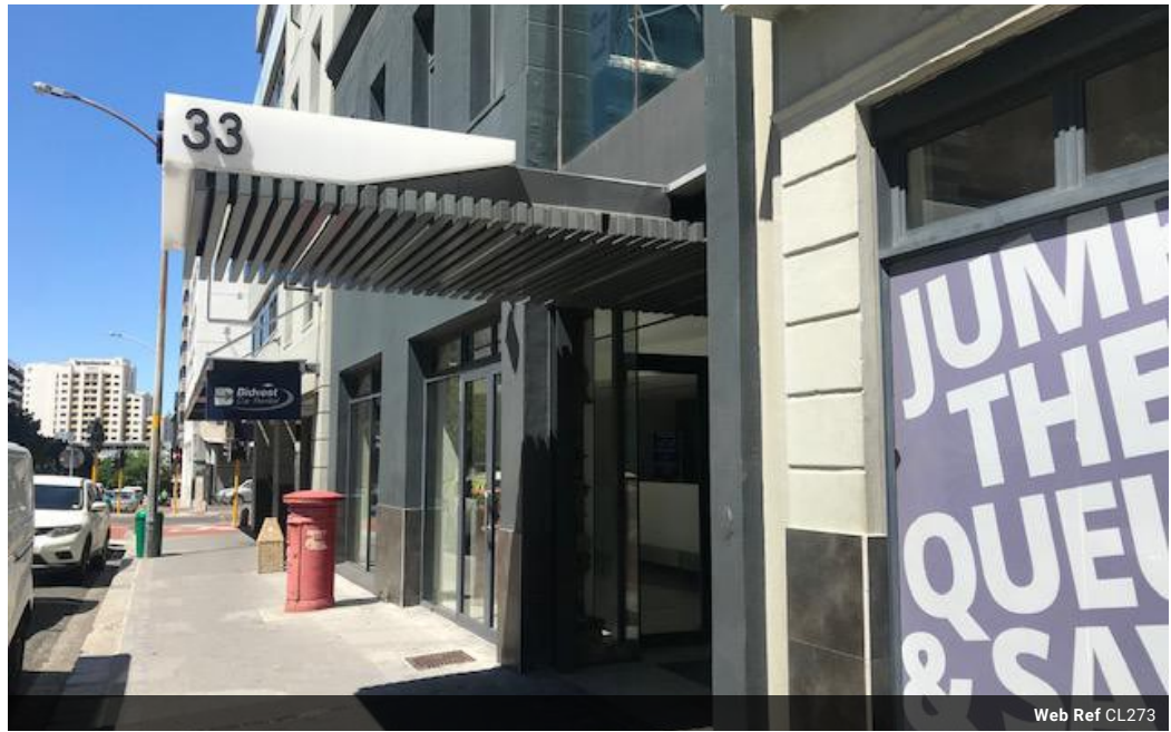
Web Ref CL273

Suite 304, 47 on Strand, Strand Street, Cape Town