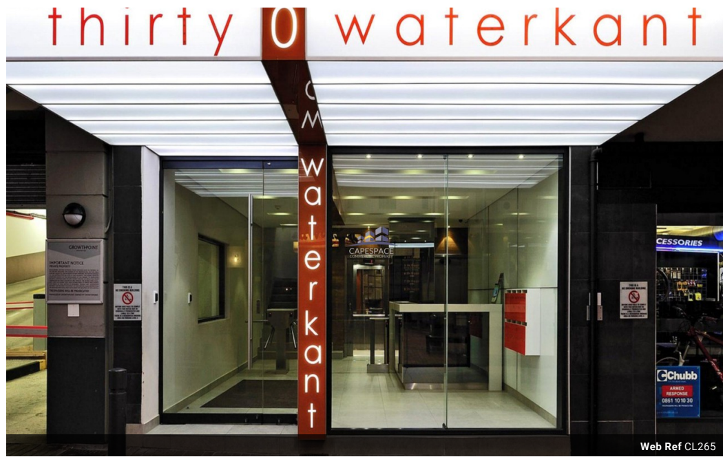
Web Ref CL265

Suite 304, 47 on Strand, Strand Street, Cape Town