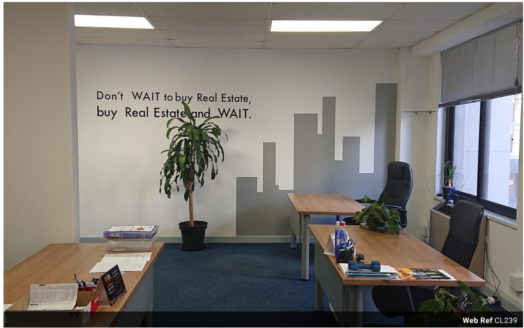
Web Ref CL239

Suite 304, 47 on Strand, Strand Street, Cape Town