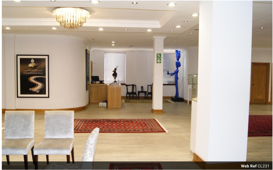
Web Ref CL231

Suite 304, 47 on Strand, Strand Street, Cape Town